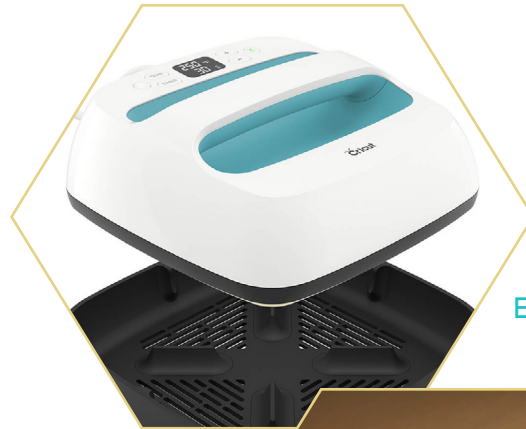
Easy Press $149.99

4. Brayer – If you have been able to use the new Cricut™ Maker, you know how fabulous it is for fabric projects. The Brayer helps you lay out your fabric on the Fabric Grip Mat with precision. Eliminate every wrinkle and bump with its smooth rubber surface. It is also great for setting your vinyl, paper and other cutting materials!