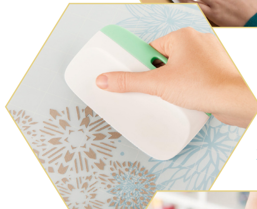
XL Scraper $7.49